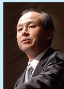
Vice Chairman Masayoshi Son

GEIDCO's 80 start-up members come from 14 countries and regions, including 2 individual members, 10 social organizations, 10 universities and R&D institutions and 58 enterprises (of which 22 are listed in the Fortune Global 500). Its first council consists of 17 members (including individuals).